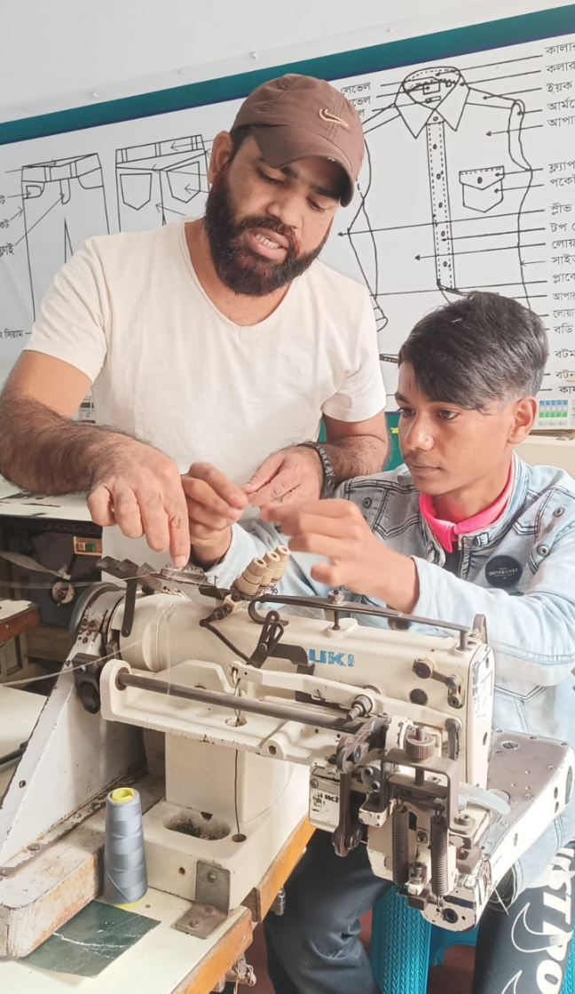
A remediation case participant undergoing vocational training.